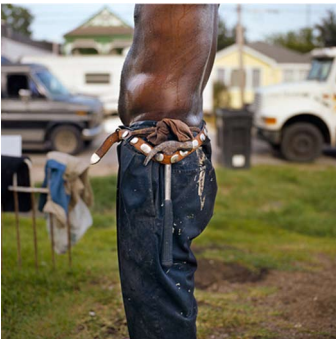
"Tool Belt," 2009 Digital C-print (2/8) 20 x 20 inches $1,500.00