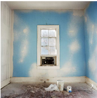
"Blue Room," 2009 Digital C-print (1/5) 30 x 30 inches $2,500.00