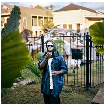
"A Friendly Spook," 2009 Digital C-print (1/5) 30 x 30 inches $2,500.00