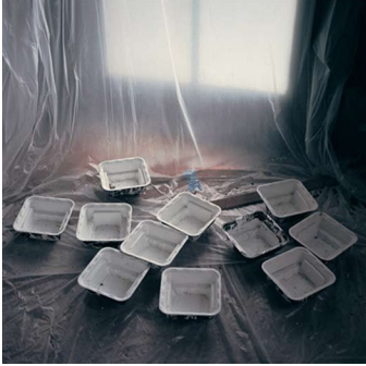
"Paint Trays," 2009 Digital C-print (1/5) 30 x 30 inches $2,500.00