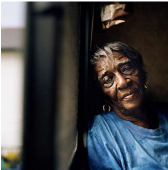
"Blue Maxine," 2009 Digital C-print (2/5) 30 x 30 inches $3,200.00