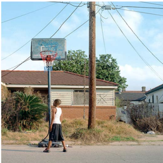
"The Hoop," 2009 Digital C-print (1/5) 30 x 30 inches $2,500.00