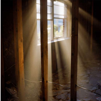
"Rays of Light," 2009 Digital C-print (1/5) 30 x 30 inches $2,500.00