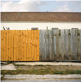
"Two-Tone Fence," 2009 Digital C-print (2/8) 20 x 20 inches $1,500.00