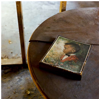
"Painting of a Boy," 2009 Digital C-print (1/8) 20 x 20 inches $1,500.00