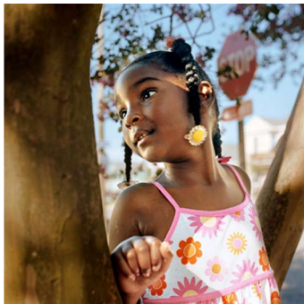
"Tree Girl," 2009 Digital C-print (1/5) 30 x 30 inches $2,500.00

Please note that each photograph is offered in two sizes. All images can be purchased at either 20 x 20 inches (Editions of 8) or 30 x 30 inches (Editions of 5).