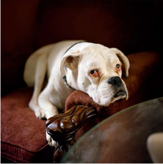
"Pinky," 2009 Digital C-print (1/8) 20 x 20 inches $1,500.00